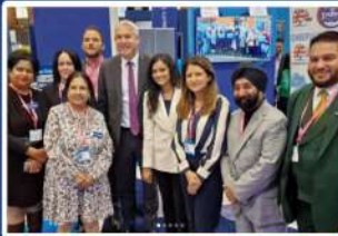
Rt Hon Steve Barclay MP then Secretary of State for Health and Social Care Department at CFONHS Stand