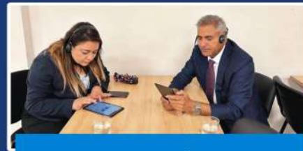
CFONHS Connect Calling at CCHQ