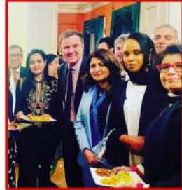
CFONHS at No 10 for the Iftar Party with Rt Hon Greg Hands MP