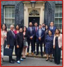
CFONHS at No 10 for a Round Table Conference with the Health Advisor