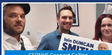
CFONHS Connect Calling at Woodford and Chingford