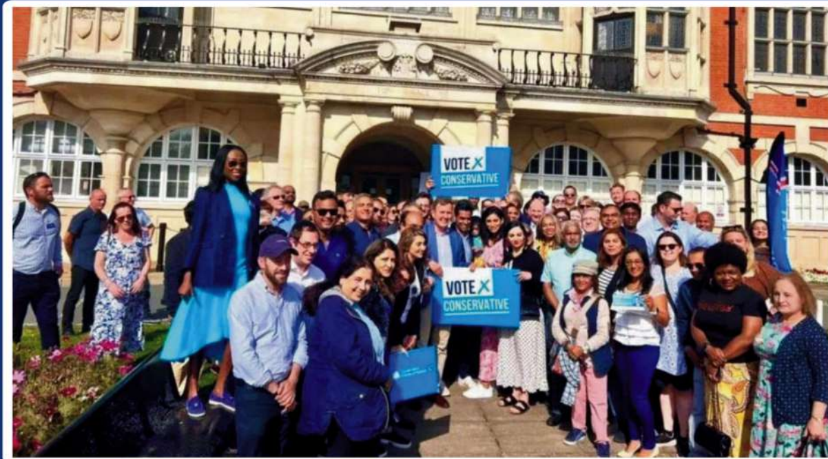
Team CFONHS Campaigning with Mayoral Candidate Susan Hall in Hendon