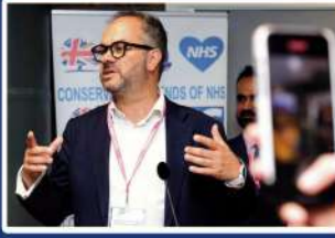
Rt Hon Paul Scully MP at the Fringe Event of CFONHS in the Annual Conference of 2023