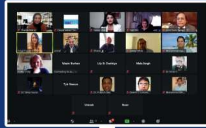
CFONHS webinar with Rt Hon Vicky Grace Ford MP then Minister of Department for Education