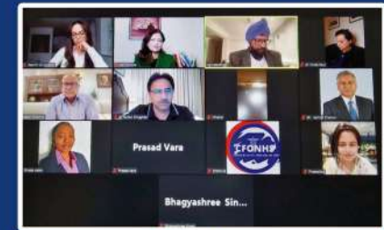
CFONHS webinar on NHS Agency Costs Versus Permanent Staff Recruitment