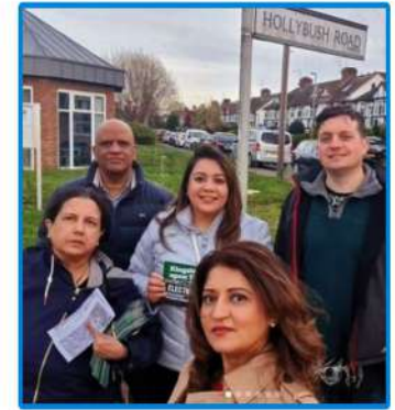
CFONHS Campaigning for Lord Zac Gold Smith in Kingston Upon Thames