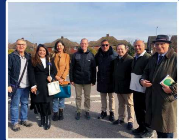
CFONHS Campaigning for then Deputy PM Dominic Raab at Walton