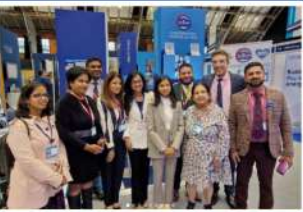
First Lady Akshata Murthy the PM's wife visited CFONHS Stand at the party Conference