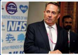
Rt Hon Liam Fox MP at the Fringe Event of CFONHS in the Annual Conference of 2023