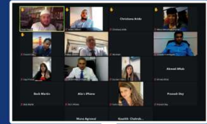
CFONHS webinar to Discuss Recommendations to Improve DNA's