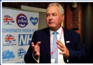
Rt Hon Bob Blackman MP at the Fringe Event of CFONHS in the Annual Conference of 2023