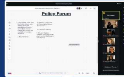
CFONHS webinar to Discuss Policy Forum to Improve NHS