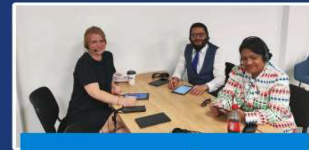
CFONHS Connect Calling at CCHQ