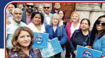
CFONHS Campaigning with Rt Hon Nickie Aiken MP and Mayoral Candidate Susan Hall in Barbican