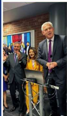
Rt Hon Steve Barclay MP then Secretary of State for Health and Social Care Department at the Fringe Event of CFONHS