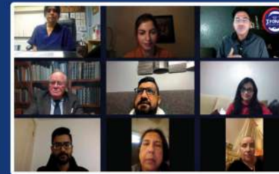
CFONHS webinar on The Use of Advanced Digital Tech and AI