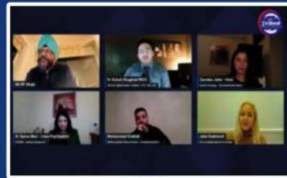
CFONHS webinar on Transformative Innovation of NHS via the Artificial Intelligence