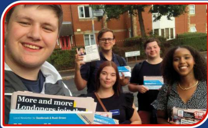
CFONHS at Campaigning in Rush Green and Eastbrook