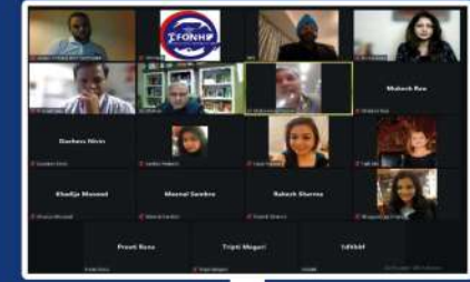
CFONHS webinar to reduce waiting lists in outpatient clinics and operation theatres