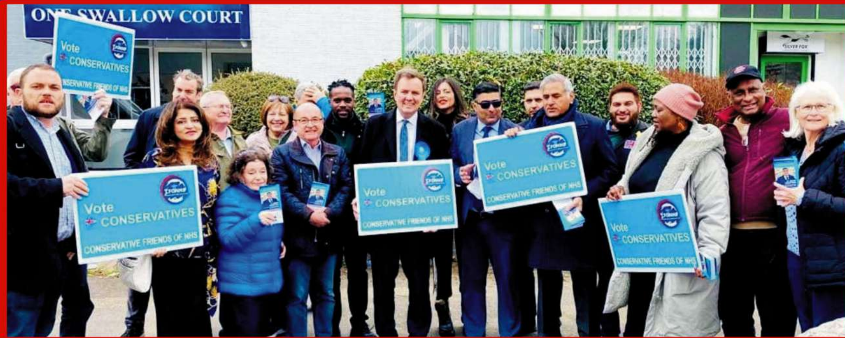
CFONHS Campaigning with former Chairman Greg Hands MP for the by-election