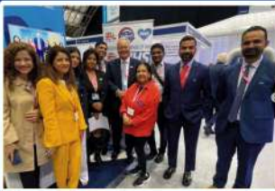
Rt Hon Bob Blackman MP visited CFONHS Stand