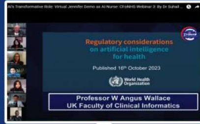
CFONHS webinar on AI's Revolutionary Influence with Virtual Jennifer in the Role of AI Nurse