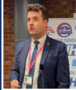
Rt Hon Elliot Collburn MP at the Fringe Event of CFONHS in the Annual Conference of 2023