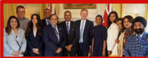
CFONHS at No 10 with Rt Hon Oliver Dowden MP