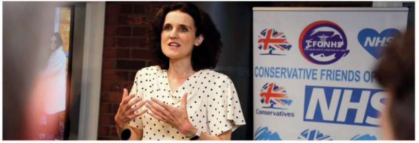
Rt Hon Theresa Villiers MP at the Fringe Event of CFONHS in the Annual Conference of 2023