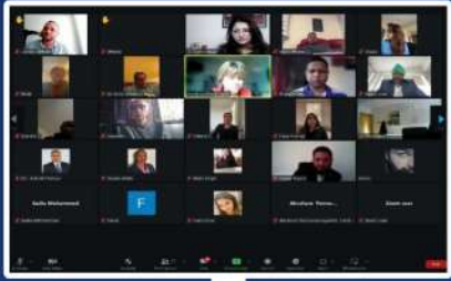
CFONHS webinar with Rt Hon Maria Caulfield MP on Government's Perspective on Mental Health Management