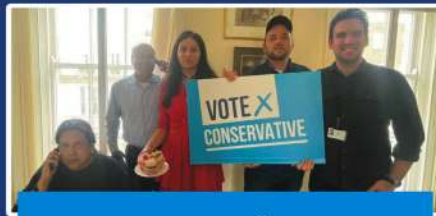
CFONHS Connect Calling at CCHQ